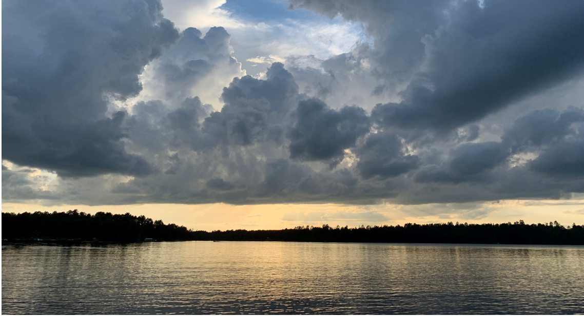
Mosher Bay Upper Manitou Lake, Ontario, Canada